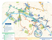
Routes and Maps Paris 2017.jpg